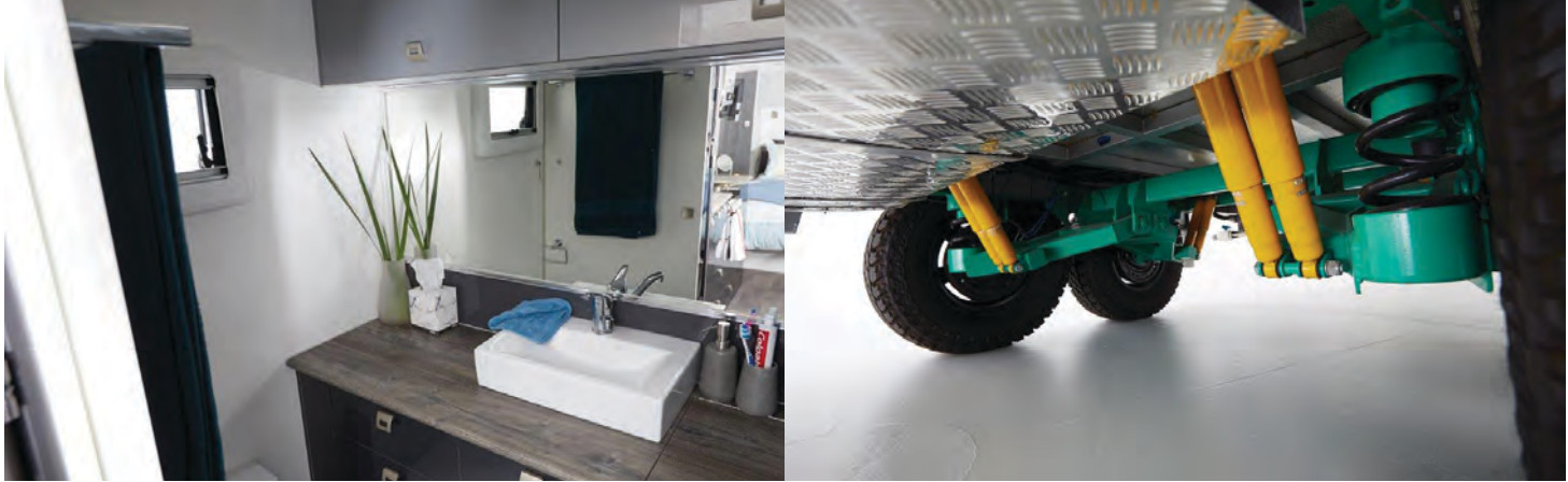
All images are for illustration purposes only. Actual model/style mary vary depending on floor plan and extras.